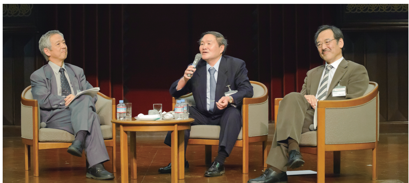
Japanese-Taiwanese Conference "Toward an East Asian Death and Life Studies" P.13