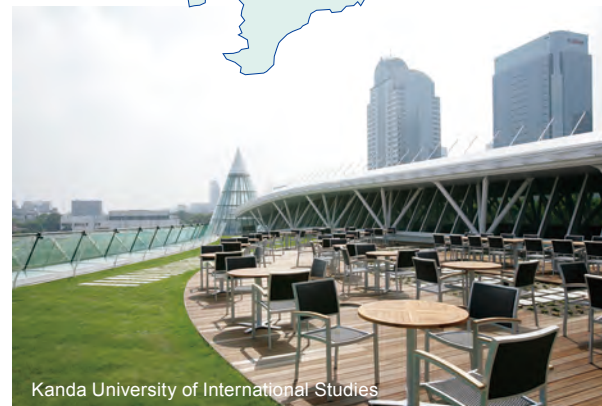
Kanda University of International Studies