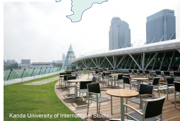
Kanda University of International Studies